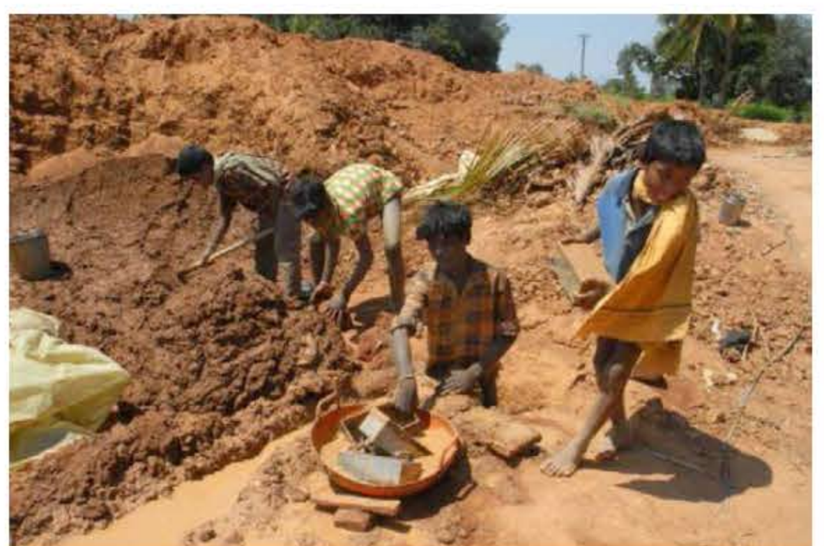
The Child Slaves of the Brick Fields should/could be at school. The cycle of Bonded Slavery could be broken with education.

Read about The Rotarian Action Group Against Slavery http://ragas.online/